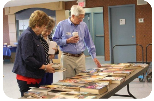
Our mobile library is expanding