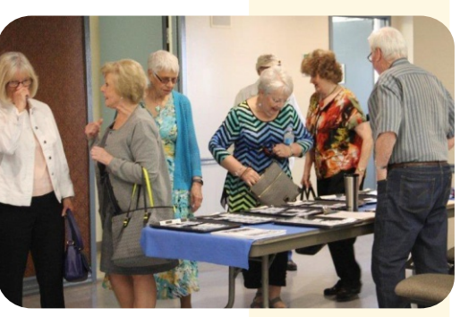
Finding our badges