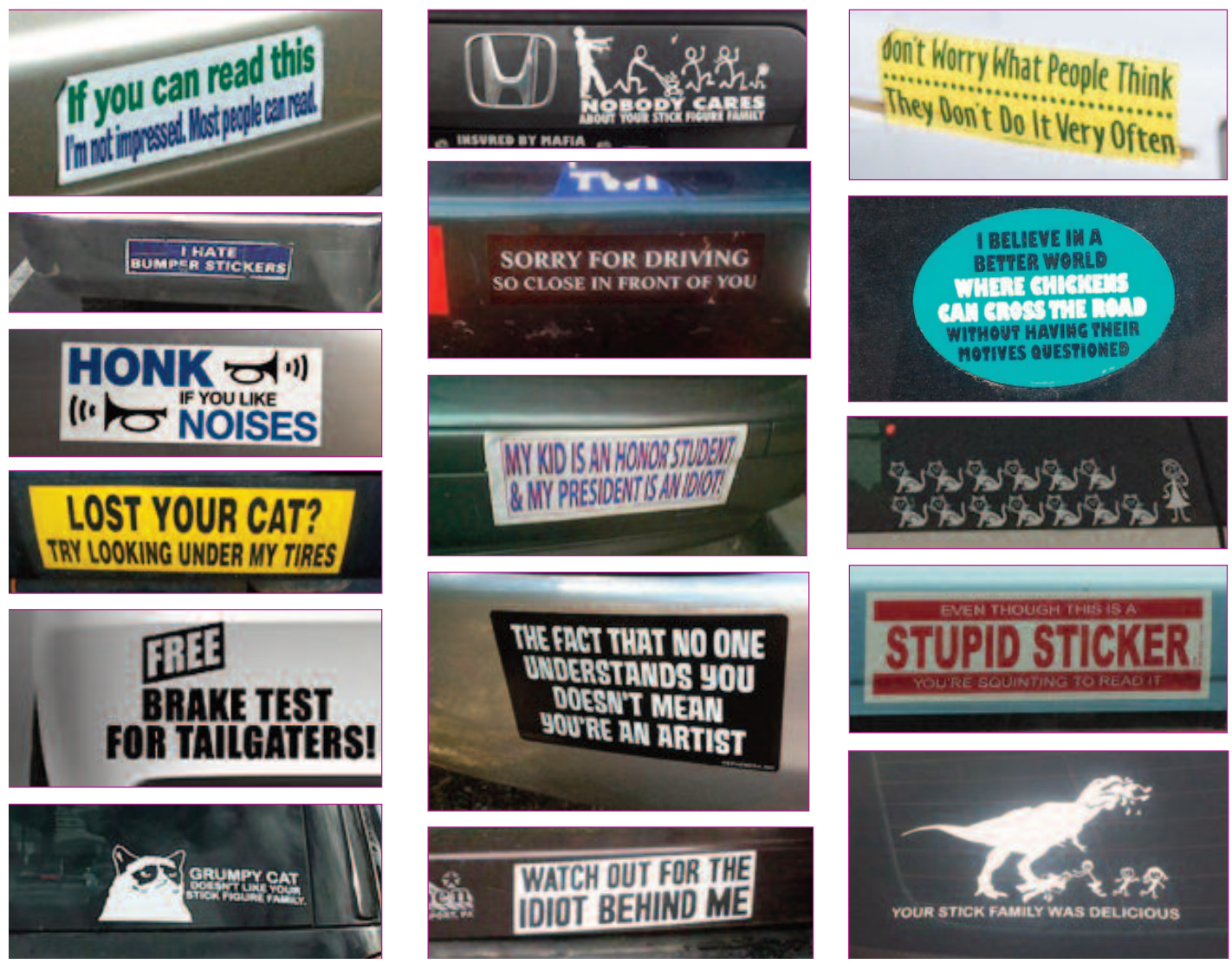
JUNE 2017 - FORUM | ESCARPMENT PROBUS CLUB NEWSMAGAZINE | Page 16

The latest iteration of bumper stickers is the irritating "stick people" decorating the rear windows of many SUVs, mainly by "cat lovers"!