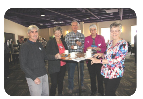
Members enjoying cookies, coffee, and tea at the break